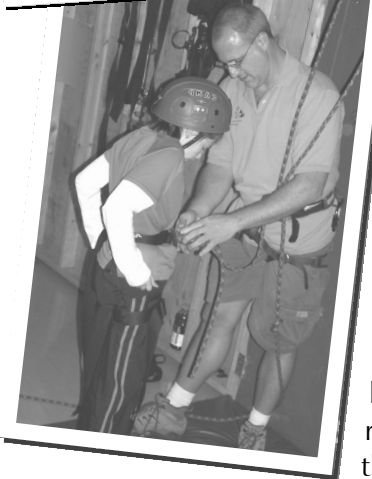
work at a Christian summer camp, which began with a three-week leadership training program. During those

As I look back—say, 28 years ago—I see a young, geeky, quiet high school kid who, while he accepted Christ at a very young age, was beginning to